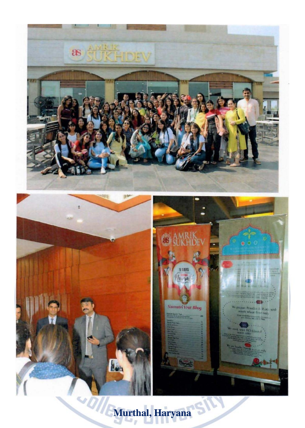
Page 12 of 14